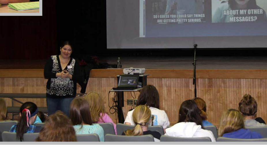
A discussion on cyber bullying, identity theft, and appropriate texting and posting.