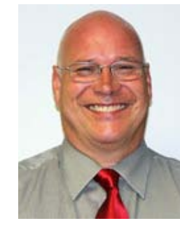
A message from the Board of Education president

I would like to begin by acknowledging the tremendous voter turnout we experienced for the recent merger vote. I arrived at 8:45 p.m. that evening and was among the many residents who waited 45 minutes or longer to vote.