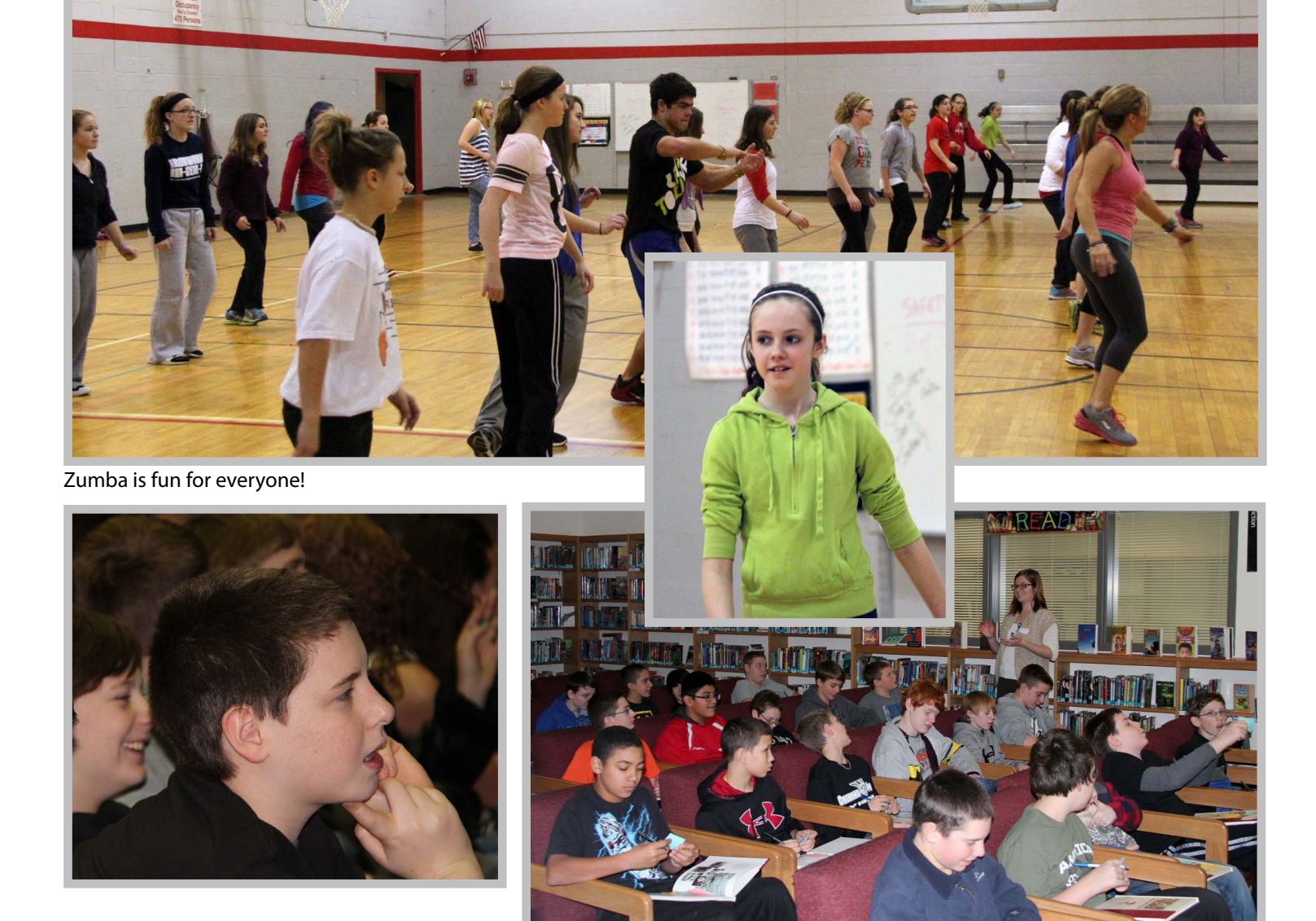
Healthy relationships, drugs & alcohol and bullying were among the day's topics..